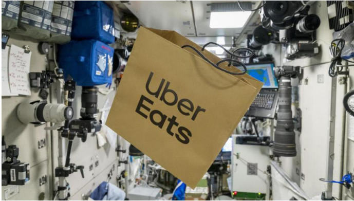
Figure 3 – Uber Eats delivery at the International Space Station