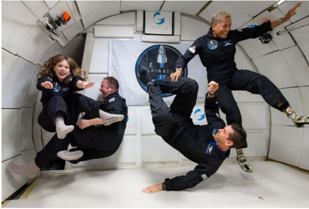
Figure 2 – Inspiration4 Crew