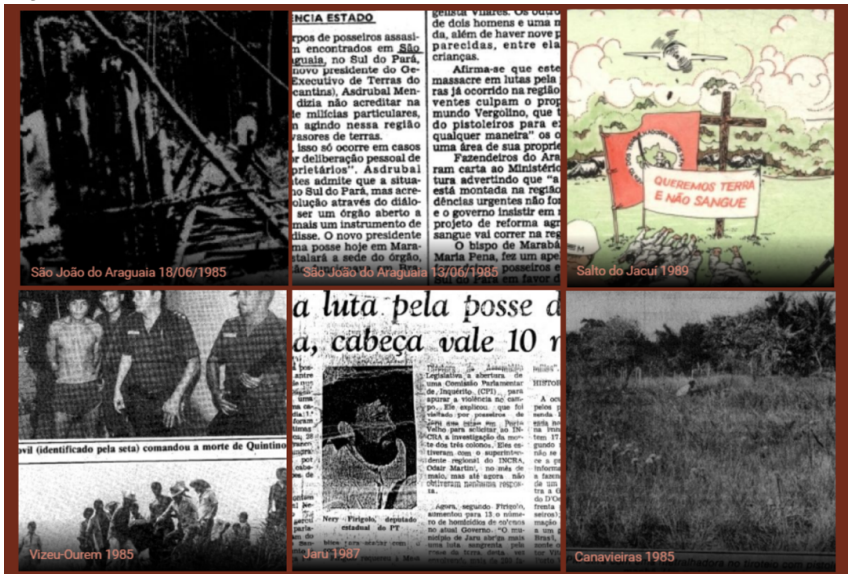
Figure 5 – Reassembly III: indiciality of the event