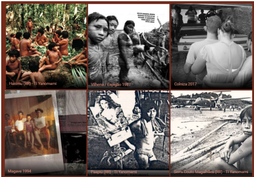
Figure 6 – Reassembly IV: survival of images, peoples, and conflicts