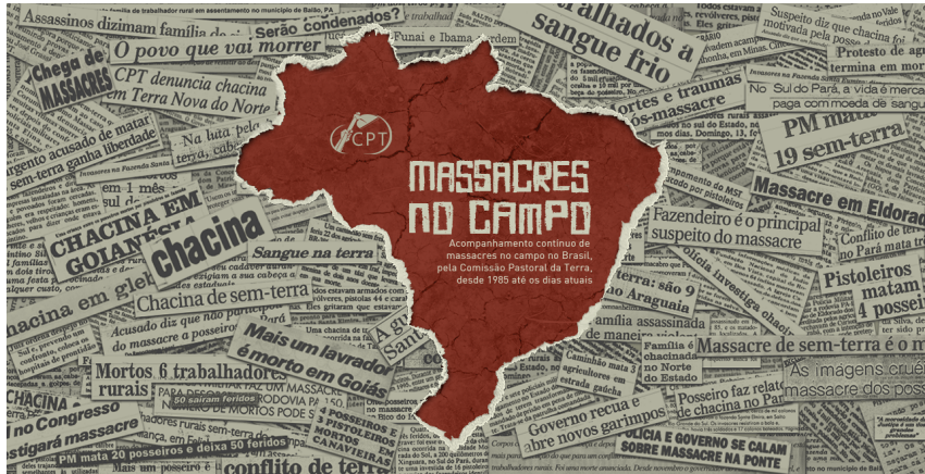
Figure 1 – Homepage of the “Massacres in the Countryside” page

page and its description: “Continuous monitoring of massacres in the countryside in Brazil, by the Pastoral Land Commission, from 1985 to the present day.” This map is immersed in newspaper clippings/headlines that reported these catastrophes. One of them is the title of this analysis — “the cruel images of the massacre of squatters.”