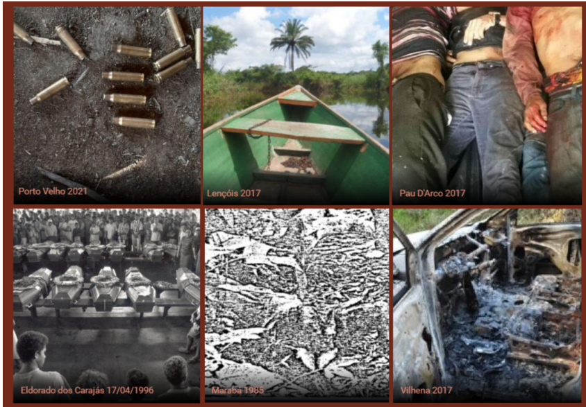
Figure 4 – Reassembly II: indiciality of violence