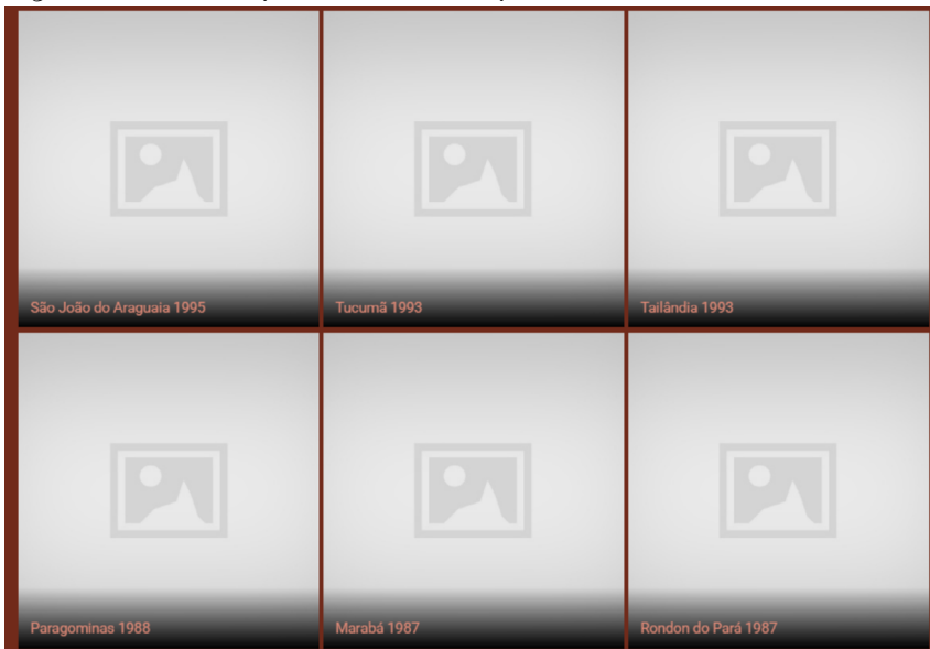
Figure 3 – Reassembly I: iconic invisibility