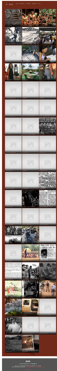
Figure 2 – Image plate of massacres in the countryside by CPT