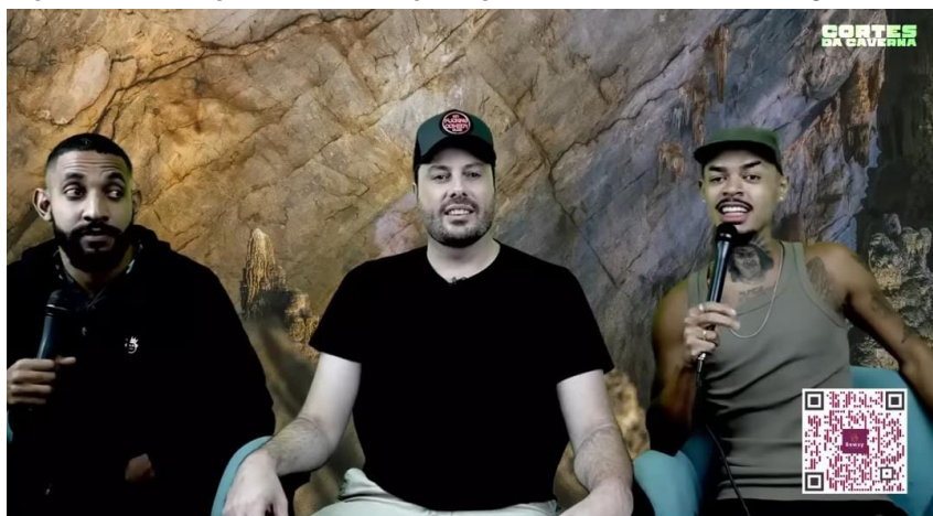
Figure 1 – A setting similar to video game graphics in the Caverna do Ogro podcast

man, a father, and a Christian. Dantas has tattoos and usually wears a cap, mirrored glasses, and heavy chains, typical elements of the “chavoso” style, linked to Brazilian peripheral identities and cultural manifestations such as funk (MENDES, 2024). In some episodes, they wear T-shirts and hold mugs that read “uncancellable” — a reference to the image of conservative rebellion, common among self-proclaimed “politically incorrect” comedians, whom they seek to uphold. Although the podcast’s setting varies across the corpus videos, it resembles video game graphics, with low-resolution three-dimensional images that recall rocky cave walls (Figure 1) — a relevant fact given that, as Falcão, Macedo, and Kurtz (2021) point out, the staging of toxic masculinities and the reinforcement of conservative values are frequent in spaces of gamer culture.