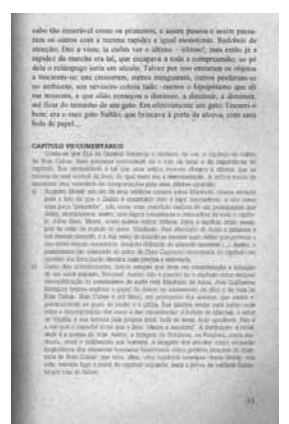
Figure 7. Cover of the book published by Editora Literatura XXI [Literature XXI Publisher] (2009). Figure 8. Front page of the book published by Editora Literatura XXI [Literature XXI Publisher] (2009). Figure 9. Page with comments in the book published by Editora Literatura XXI [Literature XXI Publisher] (2009).