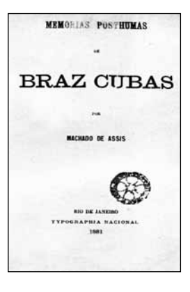
Figure 2. First page of the feuilleton text. Published in the Revista Brasileira [Brazilian Magazine] (1880), year 1, volume III. Figure 3. Last page of the feuilleton text. Published in the Revista Brasileira [Brazilian Magazine] (1880), year I, volume III. Figure 4. Cover sheet of the first book edition. Edited by the Tipografia Nacional [National Typography] (1881).