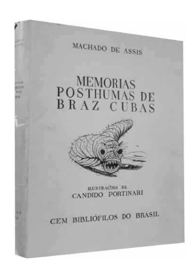
Imagen 6. Cover of the book published by the Sociedade dos Cem Bibliófilos do Brasil [Society of Brazil's Hundred Bibliophiles] (1944).

Among the luxurious editions that had already been published, it is this one which the book collectors most valorise, because only 119 copies were printed.