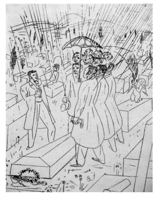
Imagen 5. O enterro , [The burial] eau-forte by Cândido Portinari (1943/1944) used as illustration.

Each edition of the collection was different from the others. In the case of Brás Cubas , the format is 28x38cm, with broad margins and the text is distributed over 316 pages. The typography which is used is with serif. On the cover, the title is enhanced and the illustrations of the worm which was the first to gnaw Brás Cuba's cold fleshes (Figure 6) – to which the text has been dedicated since the 1881 edition. Machado de Assis' and Cândido Portinari's names appear with the same weight.